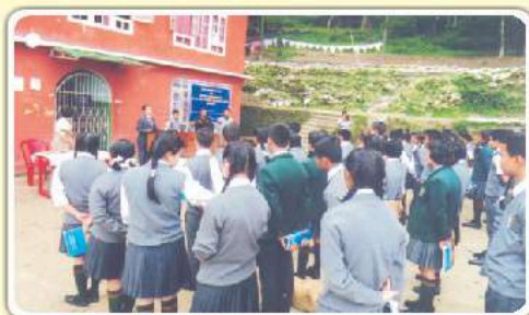
Prashanti Vidya Mandir Sec. School, Sichey, Gangtok, East Sikkim