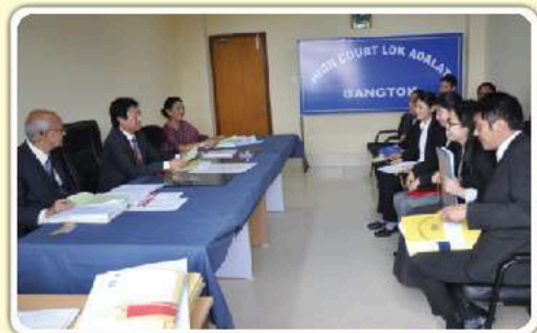
High Court Lok Adalat in progress