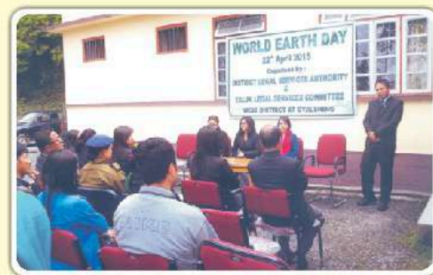
Civil Court premises, Gyalshing, West Sikkim