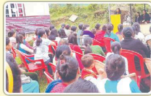
Yuksom, West Sikkim