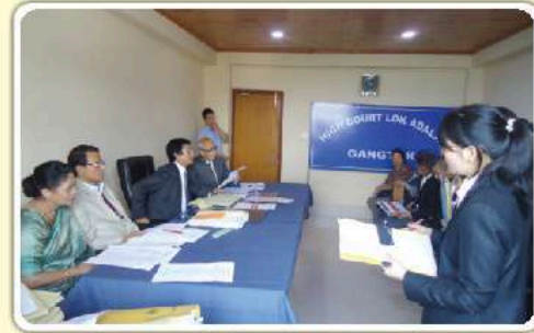
High Court Lok Adalat in progress