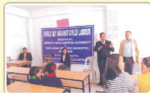
Khorong Govt. Primary School, West Sikkim