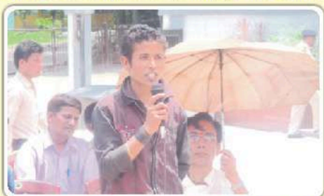
Interaction with Labour at Mamring, South Sikkim