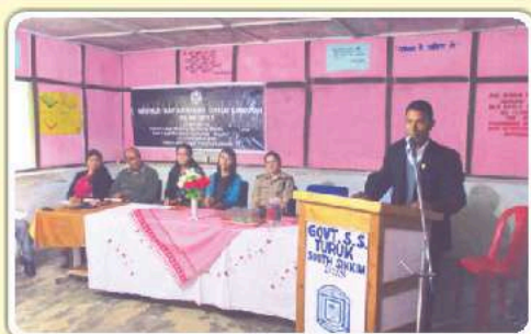
Govt. Sec. School, Turuk