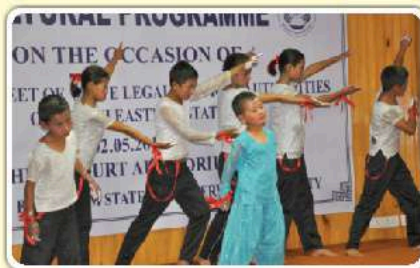
Glimpses of Cultural Programme

Similarly, Advocates and dance troupe from Cultural Department of Sikkim and Rongong Youth Club also participated in the programme.