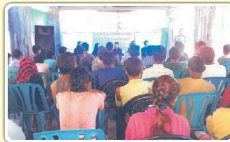
Construction site of District Court, Kyongsa, West Sikkim