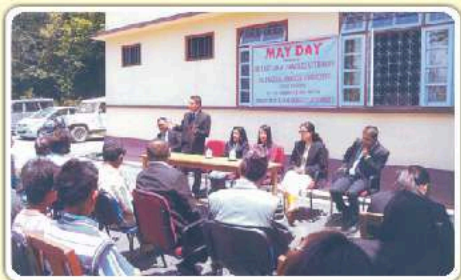
Civil Court premises, Gyalshing, West Sikkim