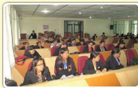
PLVs attending the training

Similarly, three days advanced training for the Para-Legal Volunteers was organized by District Legal Services Authority (West) and Taluk Legal Services Committee (West) in coordination with Sikkim State Legal Services Authority in the District Consumer Redressal Forum, Gyalshing, West Sikkim from 24 th April, 2015 to 26 th April, 2015. 06 Para-Legal Volunteers attended the training programme.