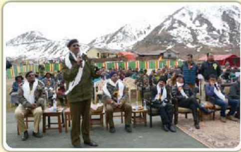
Interaction with Army Personnel during the Awareness Programme