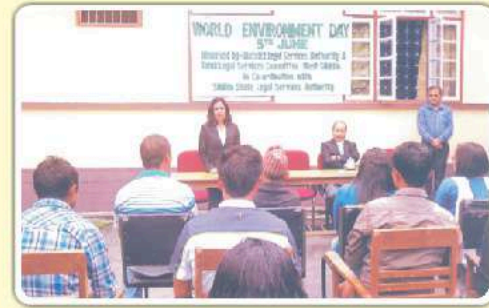
Civil Court premises, Gyalshing, West Sikkim