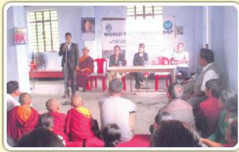
Perbing Gumpa, South Sikkim