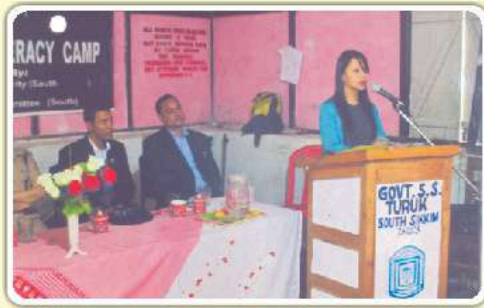
Govt. Sec. School, Turuk, South Sikkim