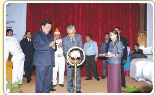
Hon'ble Mr. Justice T.S. Thakur lighting the inaugural lamp in presence of Mr. Pawan Chamling, Hon'ble Chief Minister of Sikkim

The function was attended by Hon'ble Executive Chairmen of North-Eastern SLSAs, Member Secretaries, Judicial Officers, Ex-Officio Members of Sikkim SLISA, officers from the State Departments, Panel Advocates, faculty members and students from Sikkim Government Law College and Sikkim University, and other dignitaries.