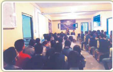
Kyi-De-Khang Sec. School, Sichey, Gangtok, East Sikkim