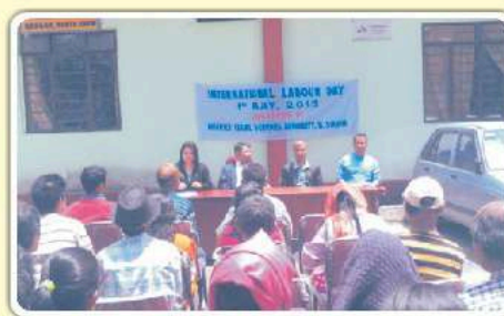
Civil Court premises, Mangan, North Sikkim