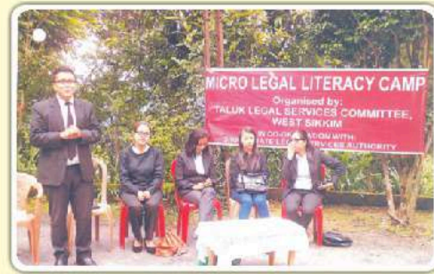
Byadong, West Sikkim