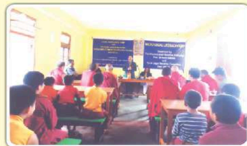
Ngor Gumpa, Rongyek, East Sikkim