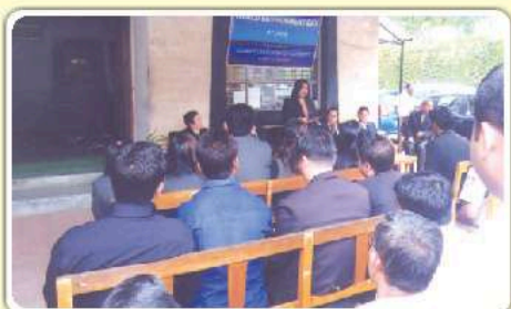
District Courts premises, East Sikkim