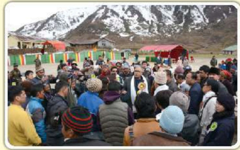
Hon'ble Mr. Justice Deepak Gupta, Chief Justice, High Court of Tripura/Patron-in-Chief, Tripura SLISA discussing with local gentries