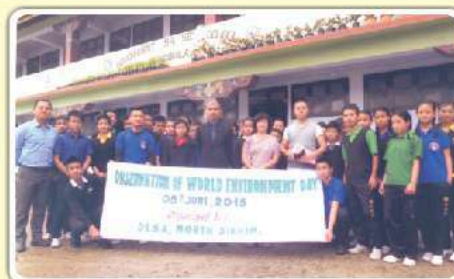
Govt. Sr. Sec. School, Mangshila, North Sikkim