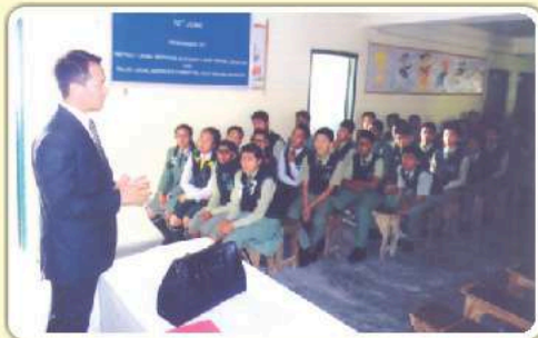
Kyi-De-Khang Sec. School, East Sikkim