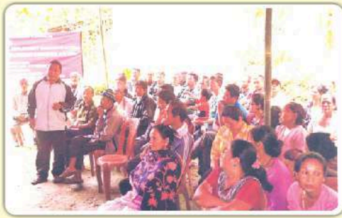
Nayabusty, Gyalshing, West Sikkim