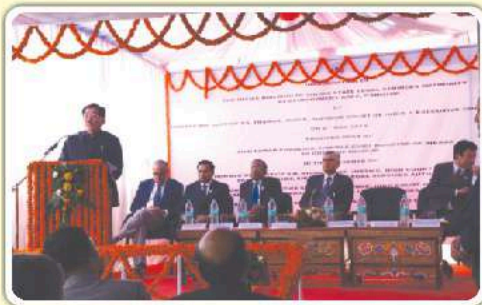
Mr. Pawan Chamling, Hon'ble Chief Minister of Sikkim delivering an address in the inaugural function