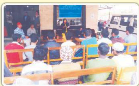
District Courts premises, Sichey, East Sikkim