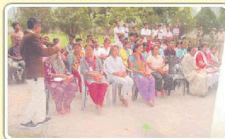
Manpur, South Sikkim