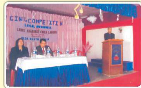
North Sikkim Academy, North Sikkim