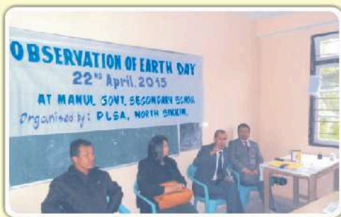
Govt. Sec. School, Manul, North Sikkim