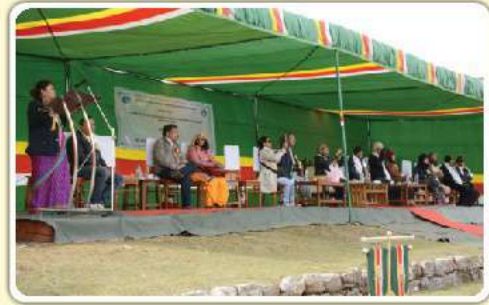
Awareness Programme at Gnathang, East Sikkim