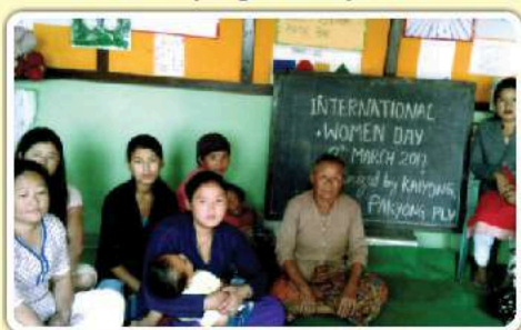
Kaiyong, Pakyong, East District

International Women's Day organized by various Para-Legal Volunteers and Legal Literacy Club, PNG School, Gangtok