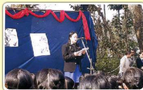
PNG School, Gangtok, East District