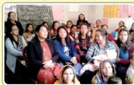
Pakyong ICDS Centre, East District