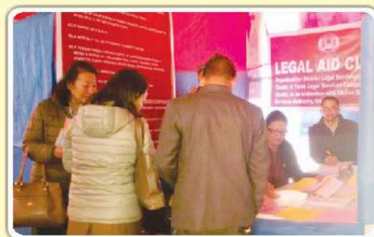
Jorethang, South District