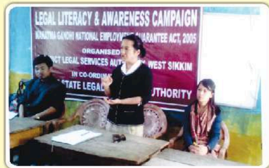
Chingthang, West Sikkim