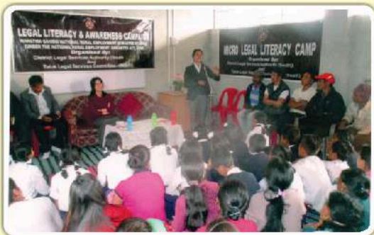
Kamerey Jr. High School, South Sikkim