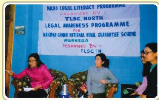
Upper Zimchung, North Sikkim