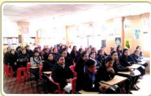
Directorate of Handicraft & Handloom Deptt., Gangtok, East Sikkim