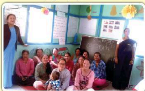
Rhenock ICDS Centre, East District