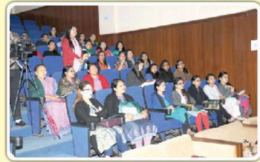
Interaction with members of Internal Complaints Committee at Mini Hall, Manan Kendra, Gangtok