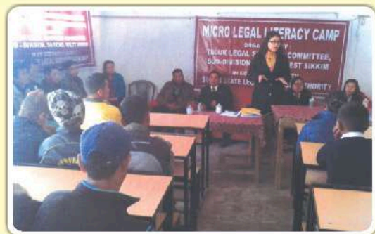
Ribdi Gout. Sr. Sec. School, Soreng Sub-Division, West Sikkim