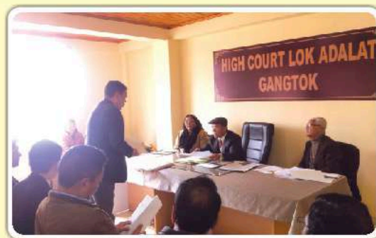
High Court Lok Adalat in progress