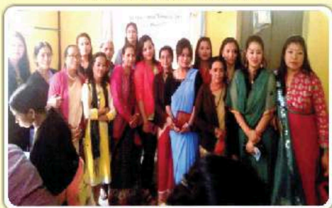
Panchayat Hall, Rhenock, East District