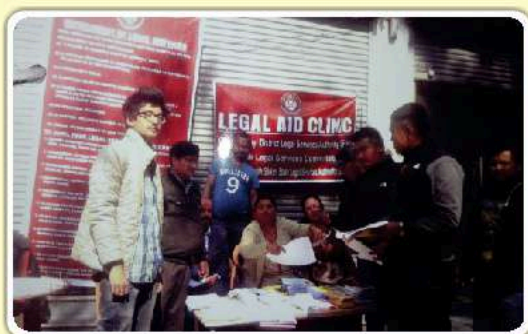
Singtam, East District