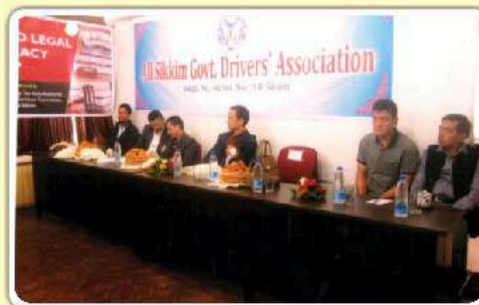
Yatayat Bhawan, Gangtok, East Sikkim