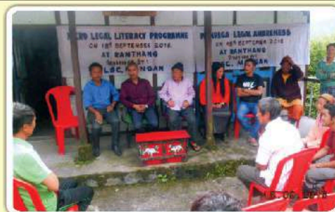
Ramthang, North Sikkim