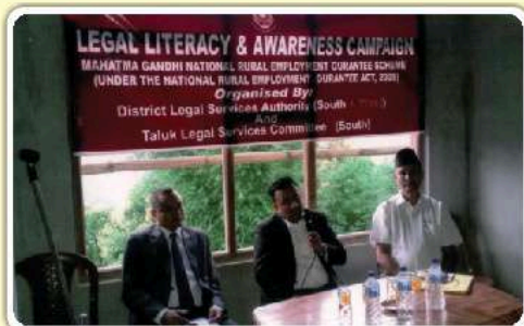
Government New Sec. School, Namchi, South Sikkim