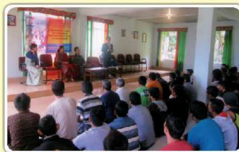
Central Prison, Ronyek, East Sikkim