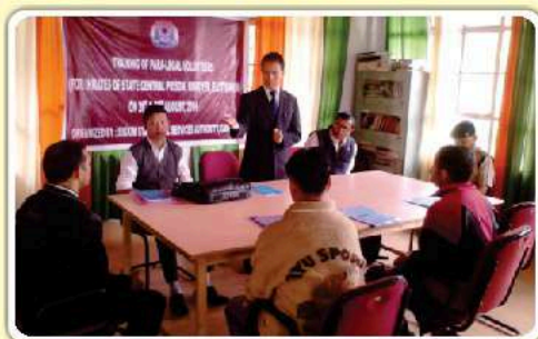
Resource Persons imparting training to three Life Convicts at State Central Prison, Rongyek, East Sikkim