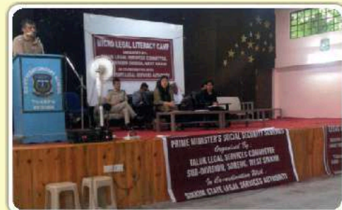
Tharpu G.P.U, Sub-Division, Soreg, West Sikkim