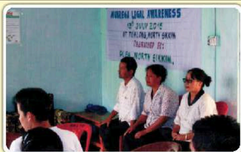
Tumlong, North Sikkim