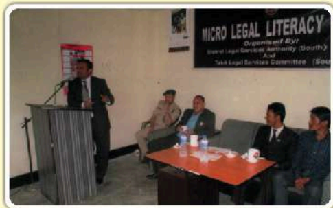
Rani Gaon, South Sikkim