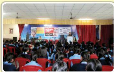
Ranka, East Sikkim