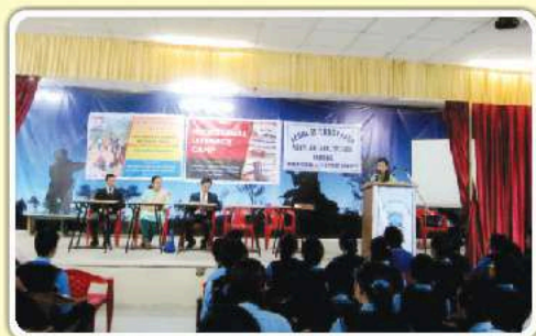
Tadong Sr. Sec. School, East Sikkim