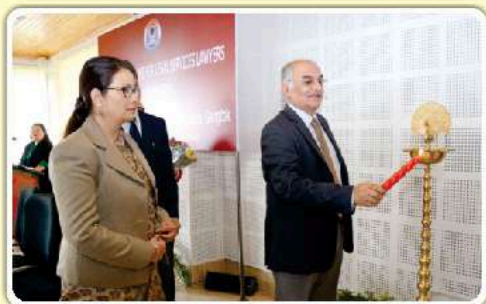
Hon'ble Dignitaries Lighting the Inaugural Lamp