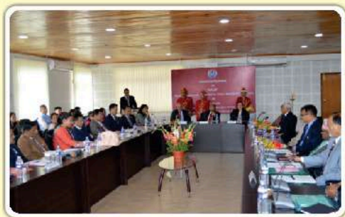
Sensitization programme in progress