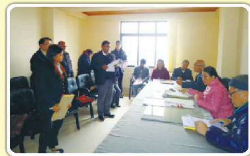
High Court Lok Adalat in progress