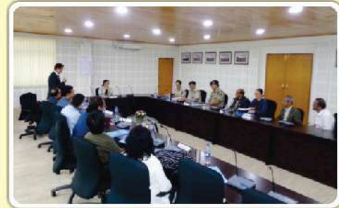
Meeting in progress