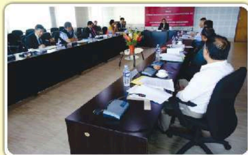
Meeting in progress