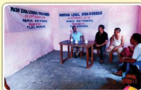
Deythang, North Sikkim