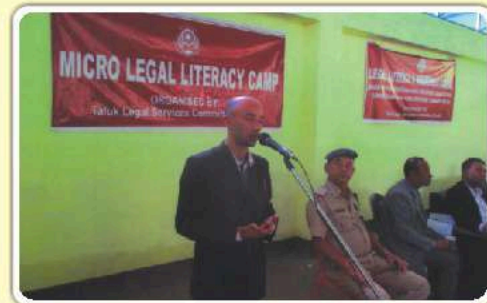
Tingmoo Panchayat Bhawan, South Sikkim