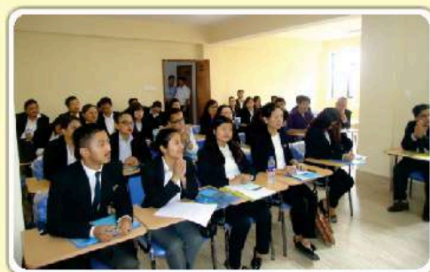
Resource Persons imparting training to Panel Advocates of Sikkim SLSA