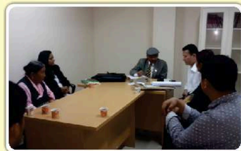
Mediation in progress