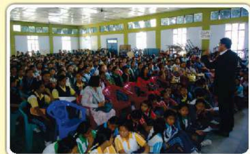
Deorali Girls Govt. Sr. Sec. School