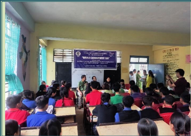
World Environment Day at Government Senior Secondary School, Ranka, Gangtok District