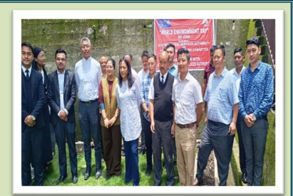
World Environment Day at District Court premises, Gyalshing