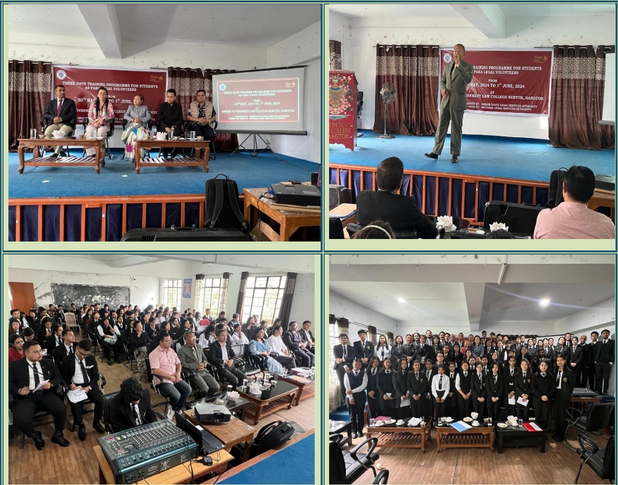
Three days training programme for students as Para-Legal Volunteers was organized by Sikkim SLSA for the students of Sikkim Government Law College and ICFAI University from 30 th May, 2024 to 1 st June, 2024 at the Moot Court Hall of Sikkim Government Law College, Burtuk