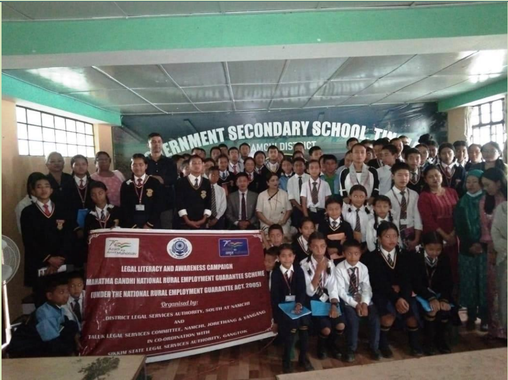
Tingley Secondary School, Namchi District