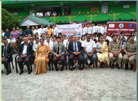
PM SHRI Government Senior Secondary School, Bermiok – Tokal, Namchi