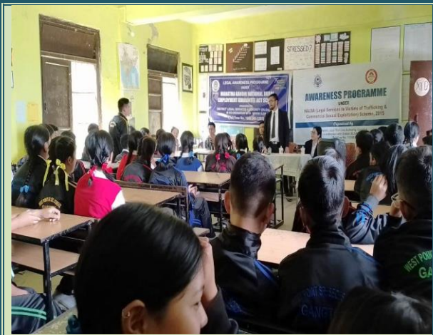
West Point Senior Secondary School, Tathangchen, Gangtok District