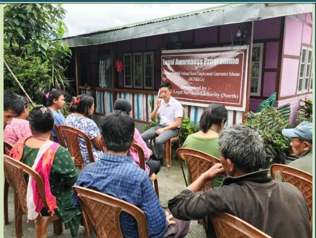
Rangrang, Mangan District