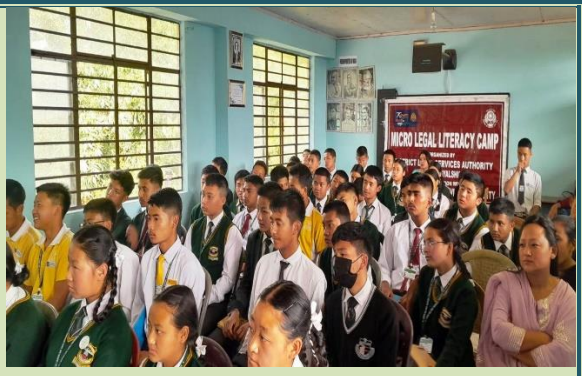
Government Senior Secondary School, Lingchom, Gyalshing District