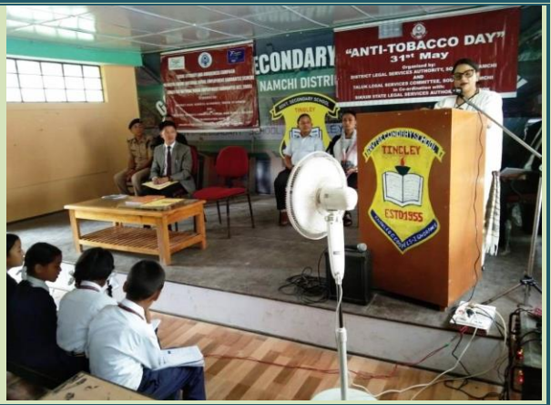
Anti – Tobacco Day at Government Secondary School, Tingley, Namchi District