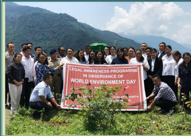
World Environment Day at District & Sessions Court, Mangan District