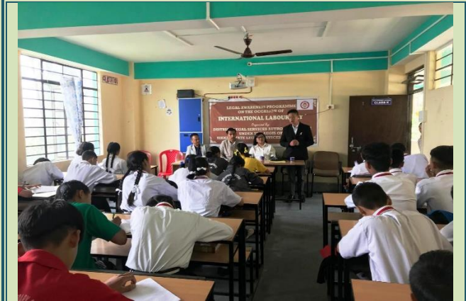
Government Secondary School, Ringhim, Mangan District