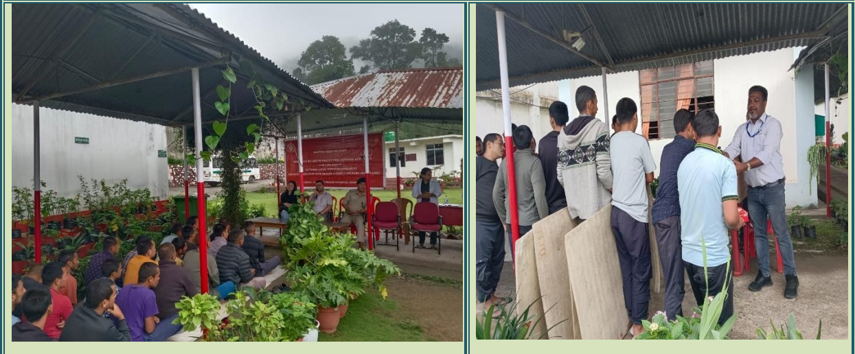
Mental Health Camp at District Prison, Boomtar, Namchi District on 15 th June, 2024