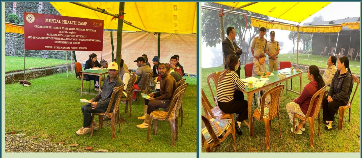
Mental Health Camp at State Central Prison, Rongyek, Gangtok District on 15 th June, 2024