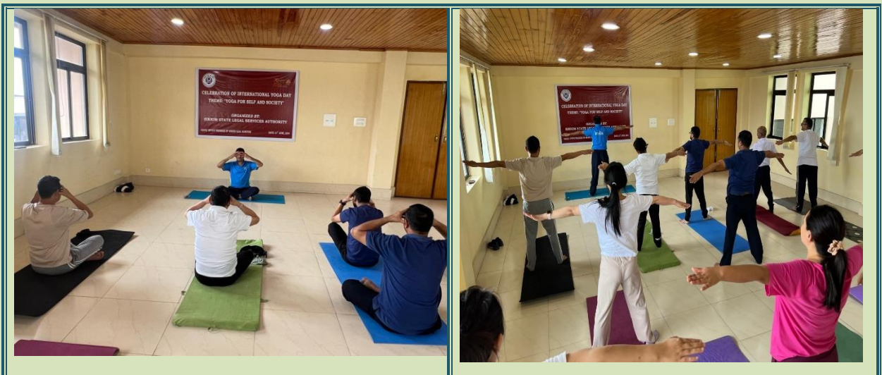
At the office of Sikkim State Legal Services Authority, Development Area, Gangtok.

The International Yoga Day was also observed by all the District Legal Services Authorities and Taluk Legal Services Committees.