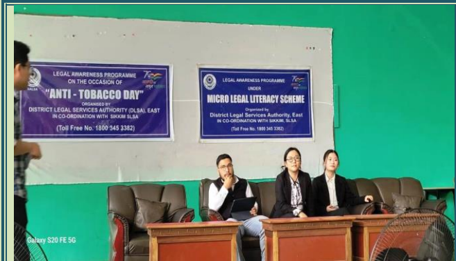
Government Secondary School, Chanatar, Rangpo, Pakyong District