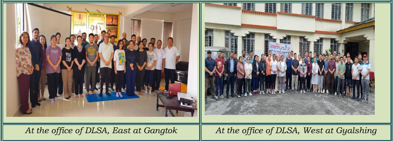
At the office of DLSA, East at Gangtok