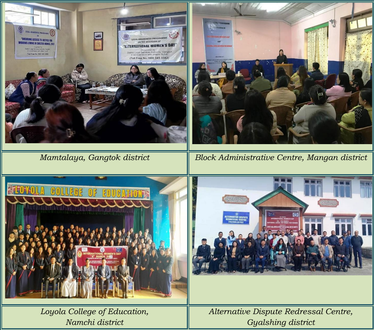
Glimpses of the awareness programme

Further, as a publicity drive, Sikkim SLSA published messages on legal rights of women in local newspapers/dailies as well as broadcasted awareness of Rights of Women in All India Radio and also disseminated awareness on Rights of Women through local cable network.