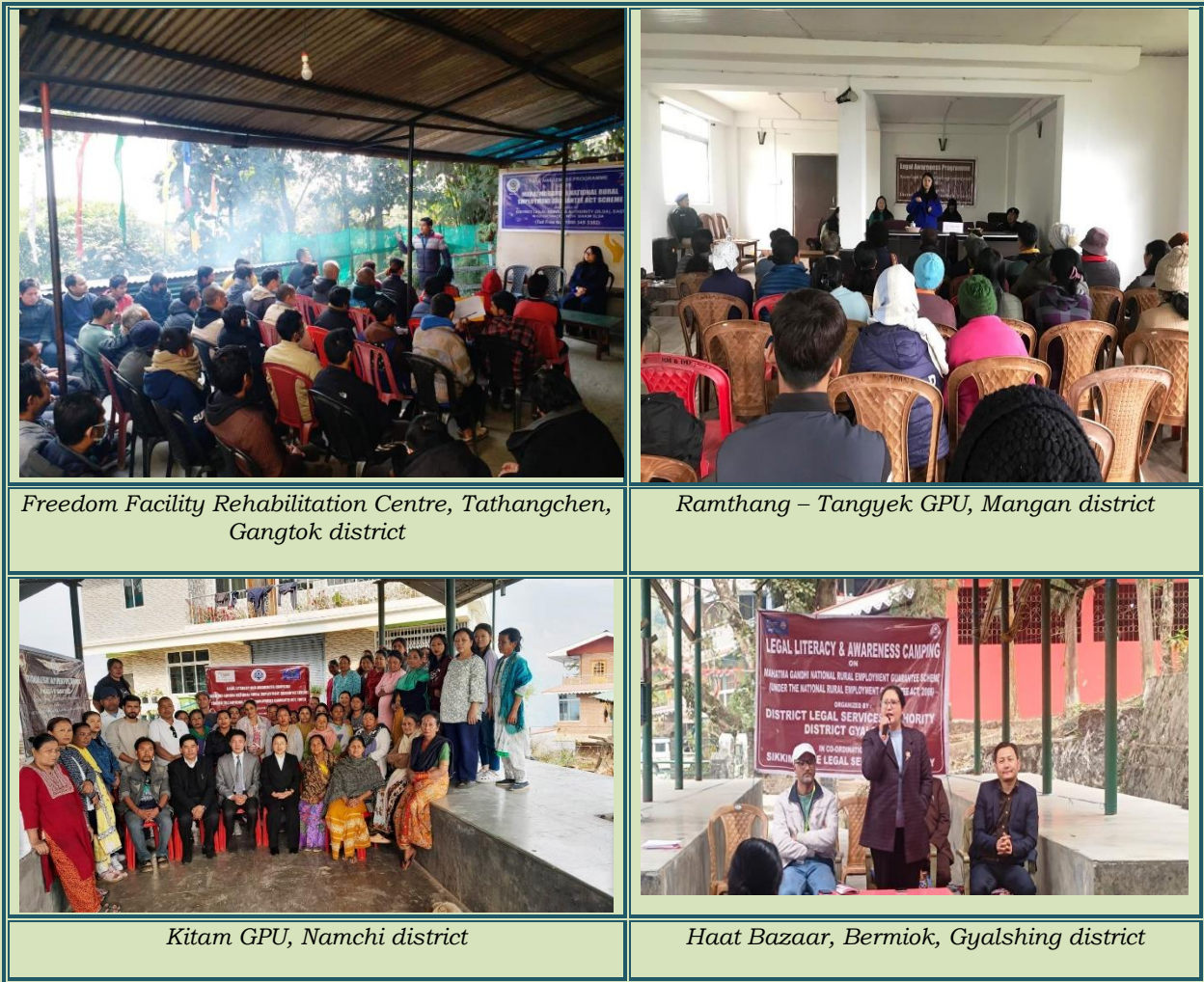
Glimpses of the awareness programme