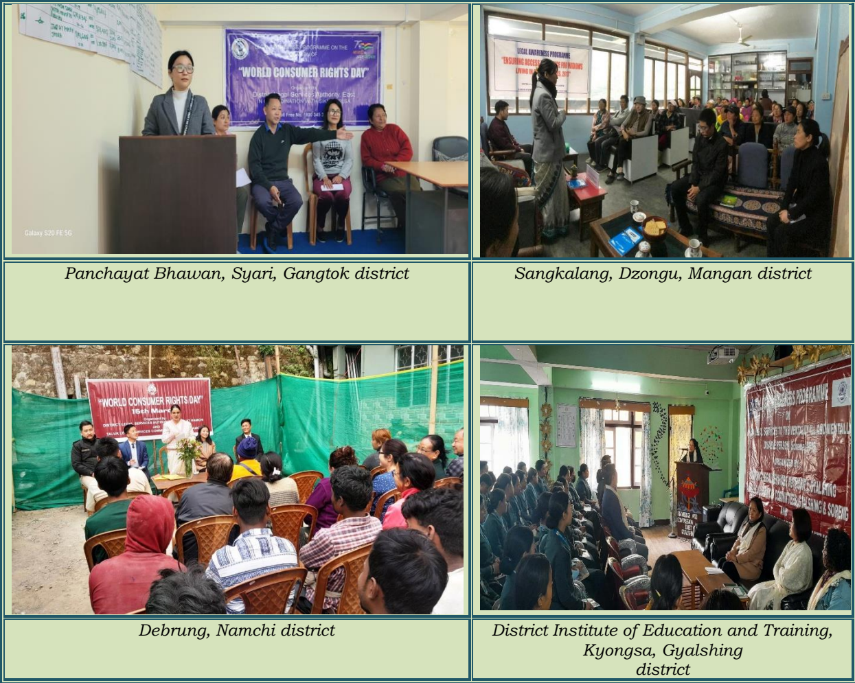
Glimpses of the awareness programme