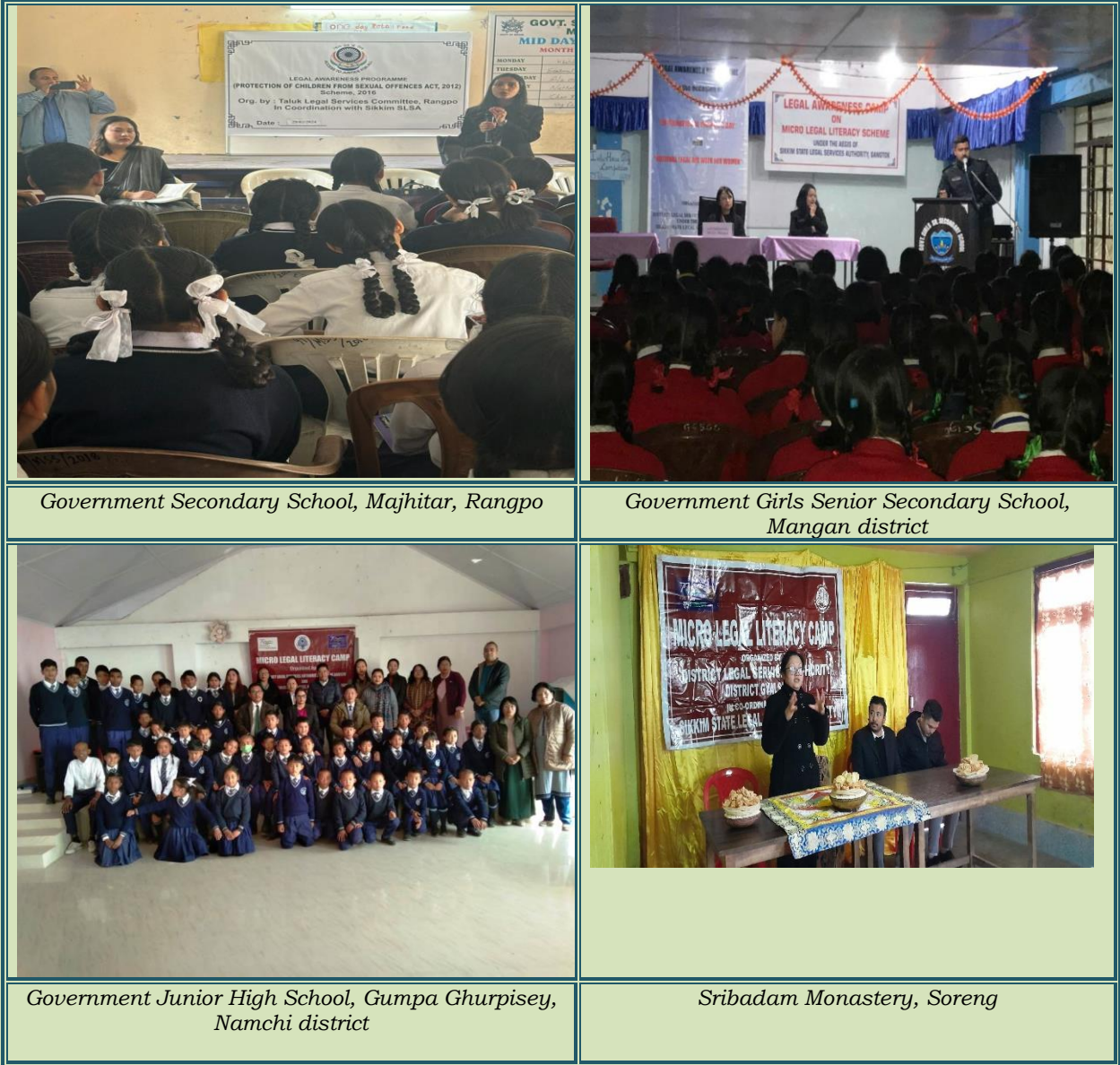
Glimpses of the awareness programme